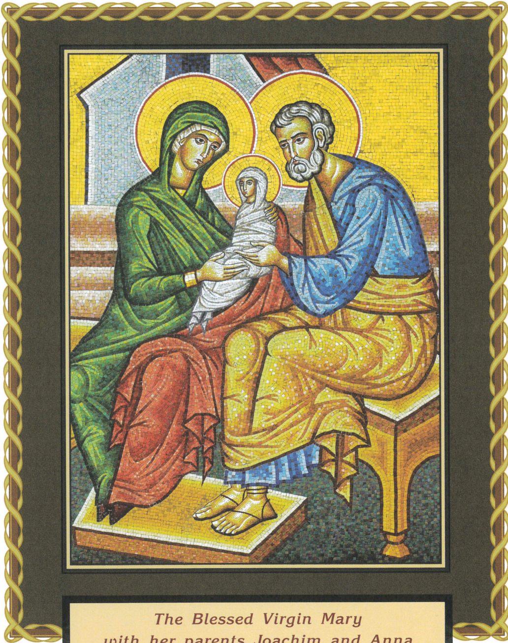
The Blessed Virgin Mary with her parents Joachim and Anna